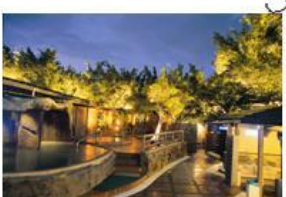
Hot Spring Bath