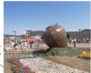
Yingko Pottery Street