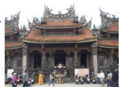
Sanhsia Tsushih Temple