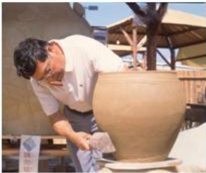
Yingko Pottery Factory